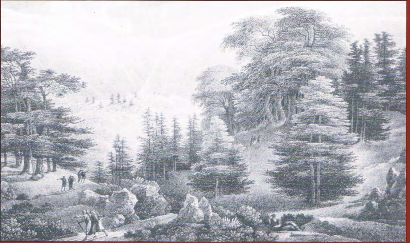
The Cedars of Lebanon. Engraving from Louis- François Cassas circa 1785.